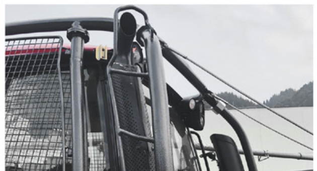
Exhaust pot protection