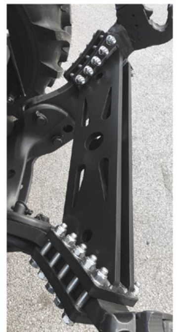
Transverse connection of front arms hydraulics