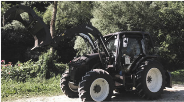
Front ramp board with fixed mounting, 1.8m wide and lift height 3m from the ground