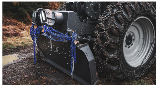
Rear board with directional pulleys and its own winding device