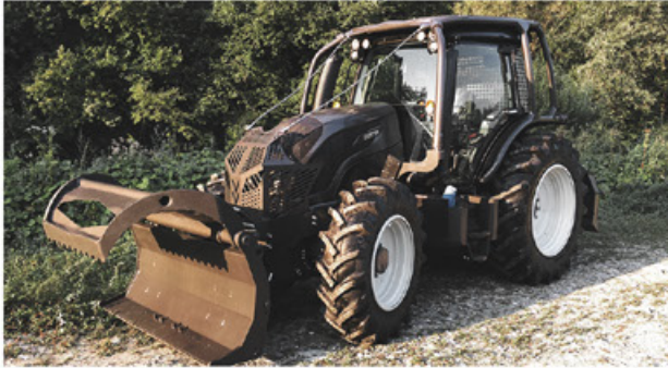
Front ramp board with fixed mounting, 1.8m wide and lift height 1m from the ground