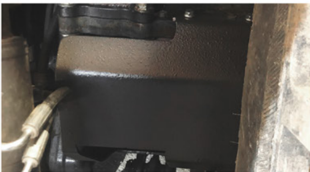
Air system protection