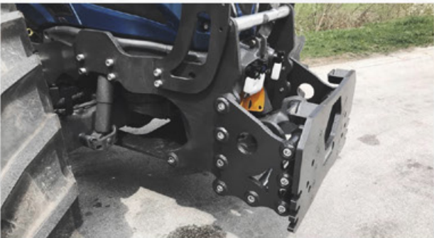
Europlate DIN 76060A