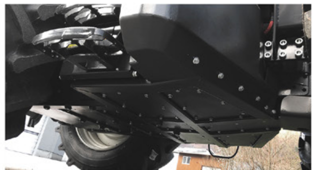
Connecting chassis made of 15 mm thick sheet metal