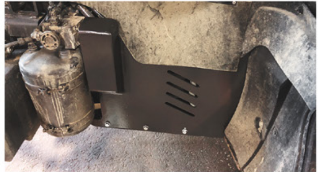
Filter system protection