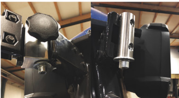
Adapter for quick disassembly of mirrors