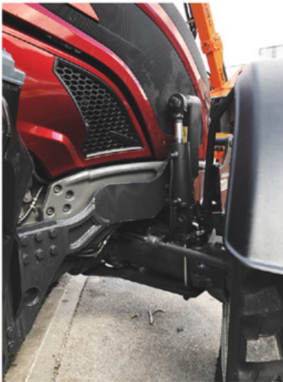
Front axle lock