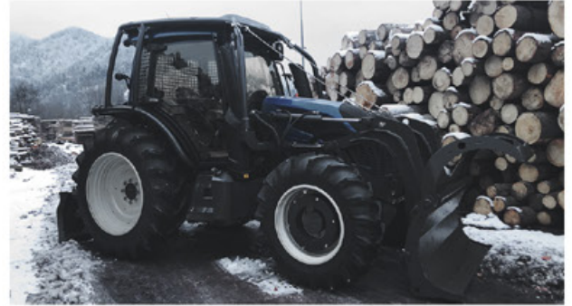
Front ramp board with fixed mounting, 1.8m wide and lift height 1,5m from the ground