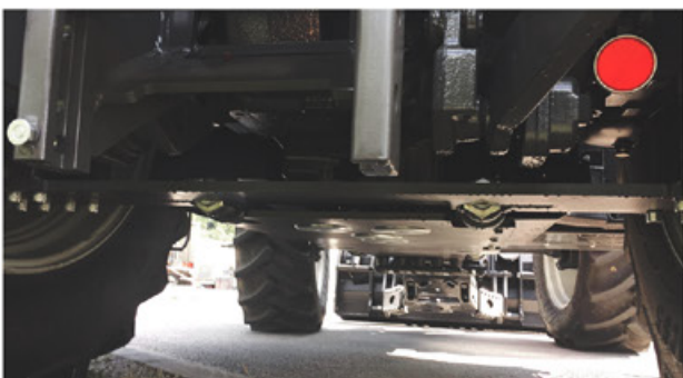
Connecting chassis made of 10 mm thick sheet metal