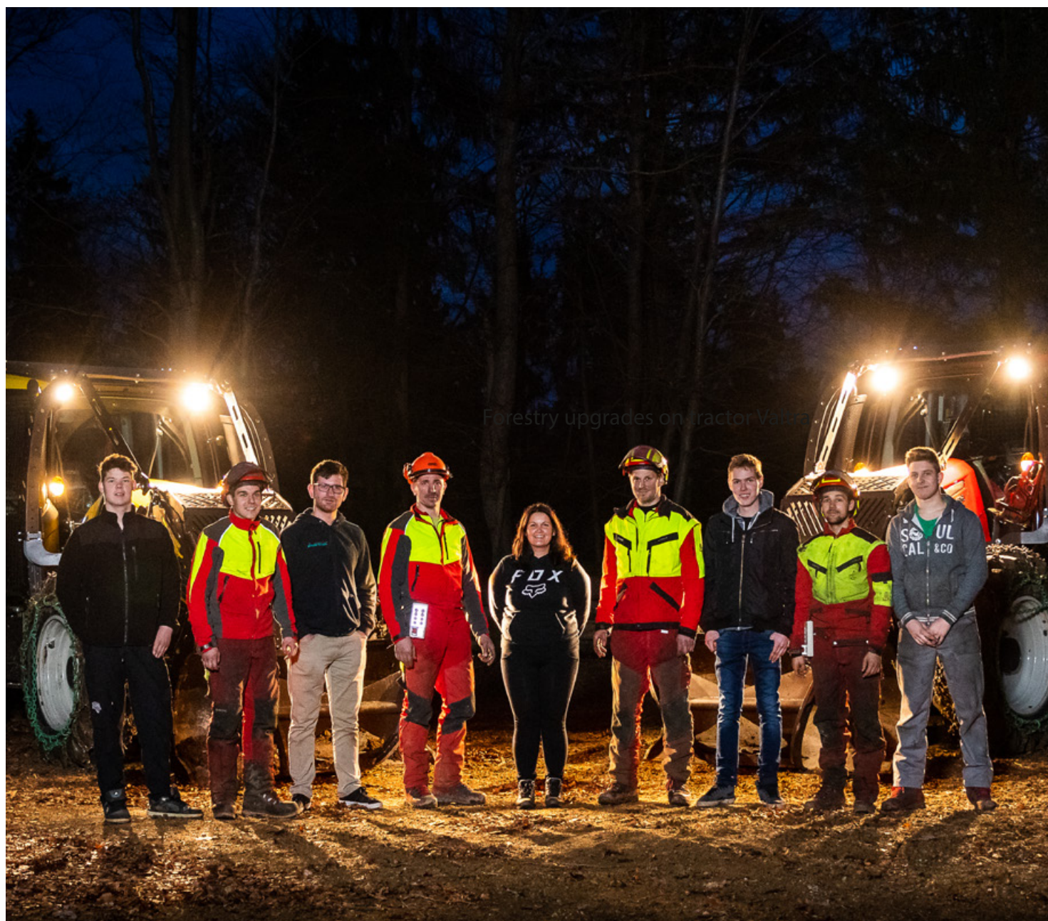
Forestry upgrades on tractor Valtra

PRO JERNAČ VMB D.O.O. Češnjica 48 A 4228 Železniki, Slovenija