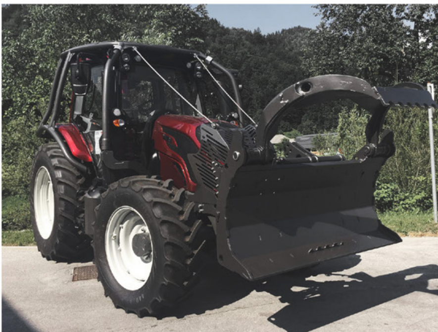
Front ramp board with three-point mounting, with or without beak