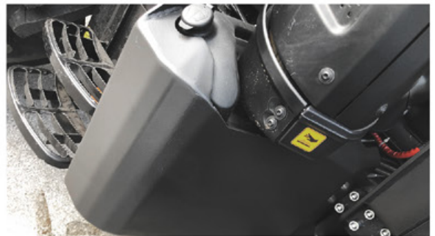
Windshield cleaner container protection