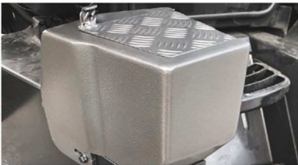
Cover protection for Ad blue and fuel tank