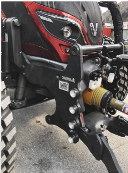
Preparation for the Europlate