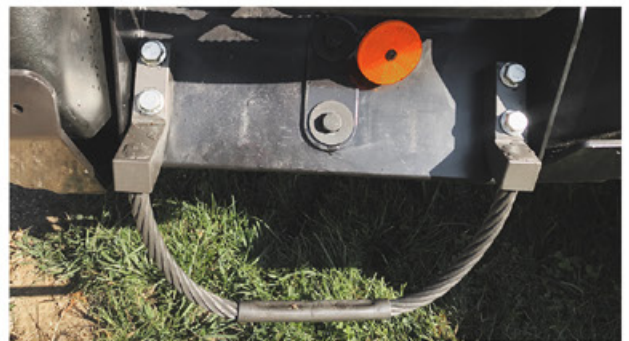
Steel cable step