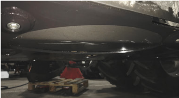
Protection for original chassis protection