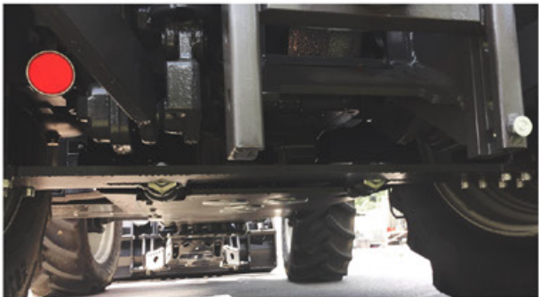
Connecting chassis made of 20 mm thick sheet metal